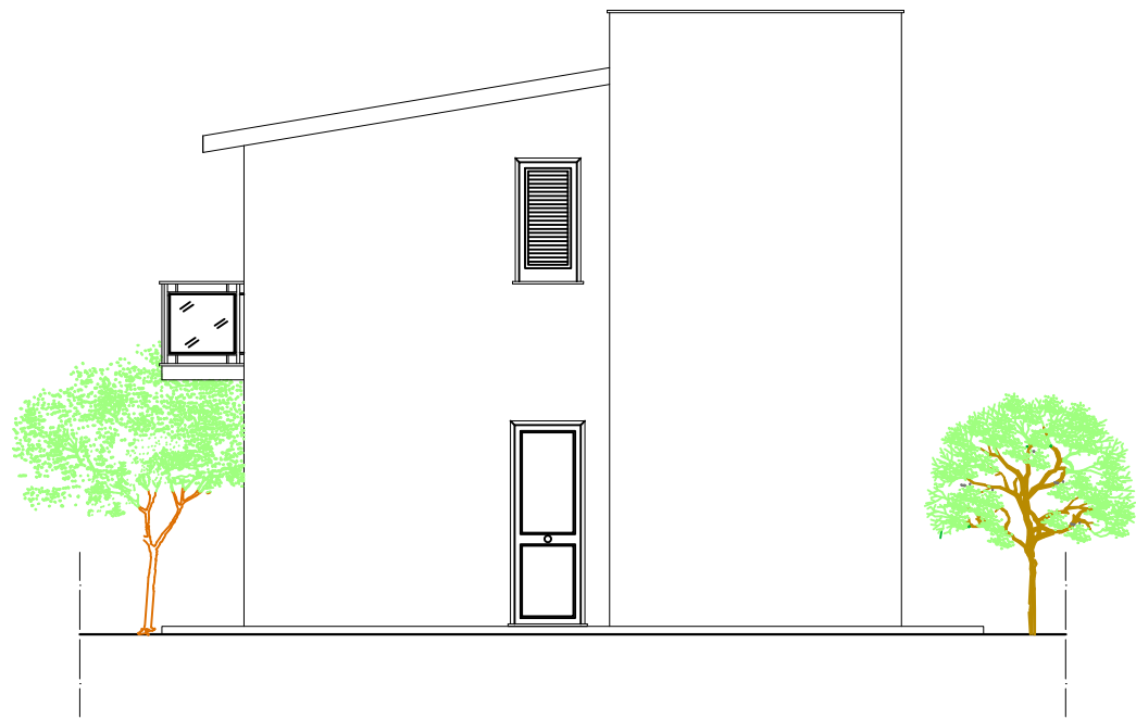
PROSPETTO "D" Scala 1:100